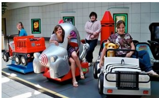
These Volunteers have fun at the mall after voting on new teen books!

To be a Volunteer is to be a valued member of PDL's behind-the-scenes team. You can be an important part of programs, library maintenance, treat and craft making. You may even get to choose new books for the teen section! Your time will be appreciated and you will gain the gratitude of the library staff and patrons.